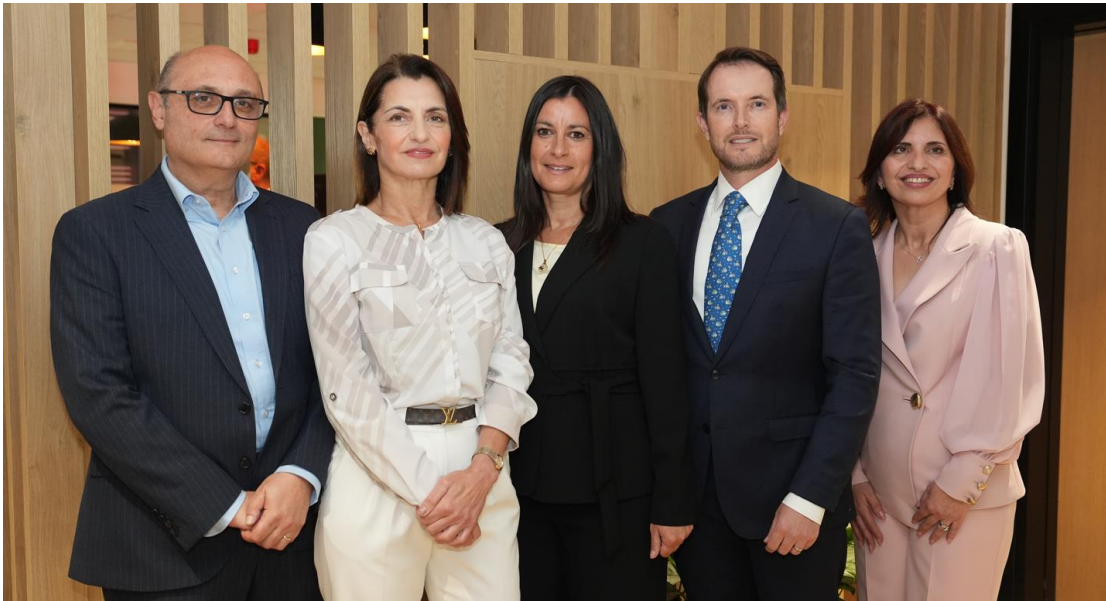
Members of the HSBC Malta Executive Team and Rabat Branch Manager attending the reception