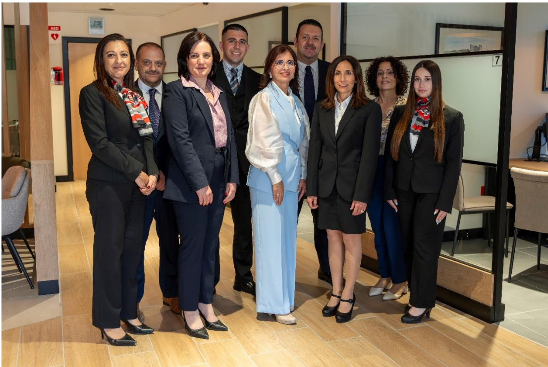
The Rabat Branch Team