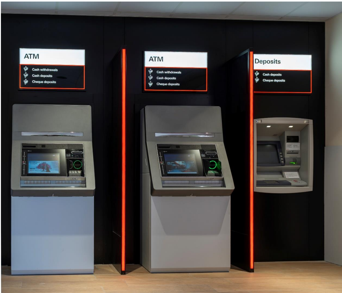
Upgraded ATMs and a deposit machine