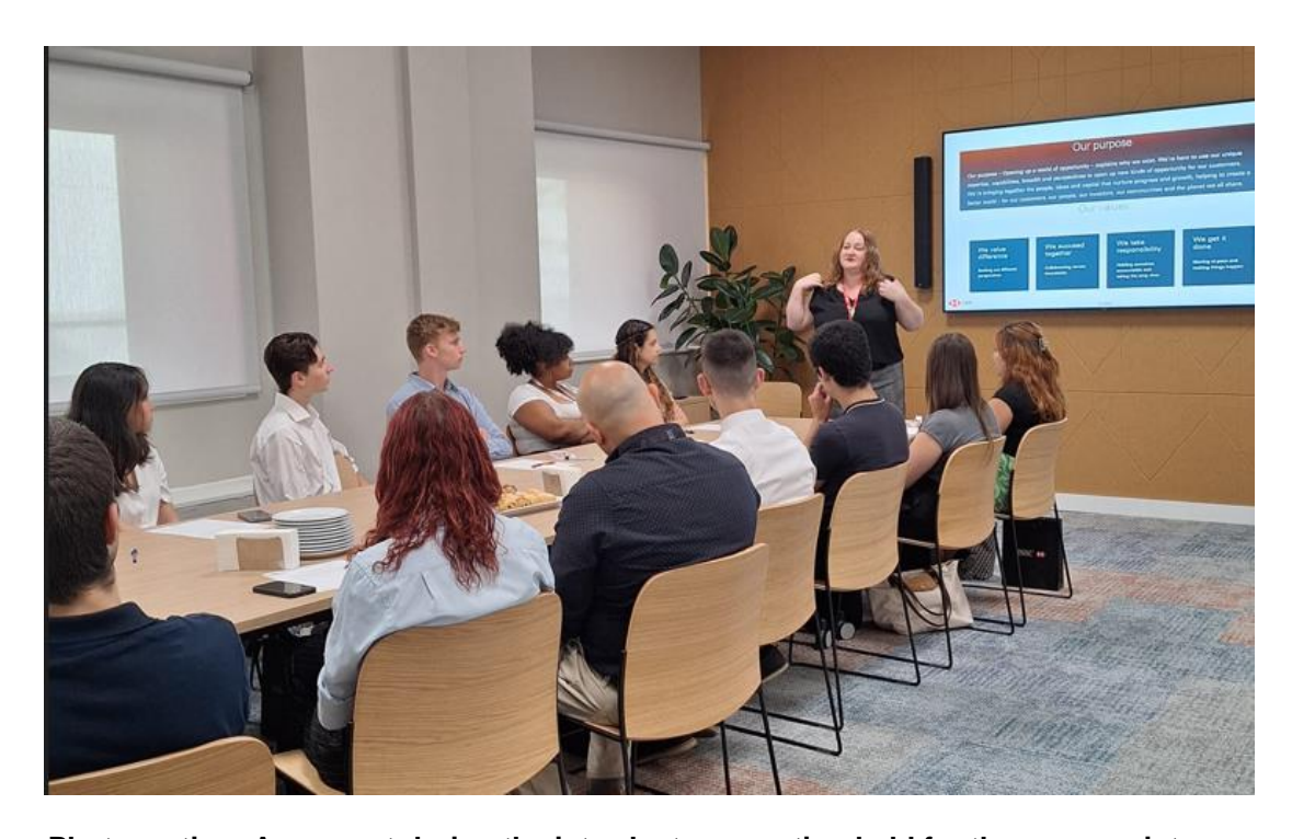
Photocaption: A moment during the introductory meeting held for the summer interns.