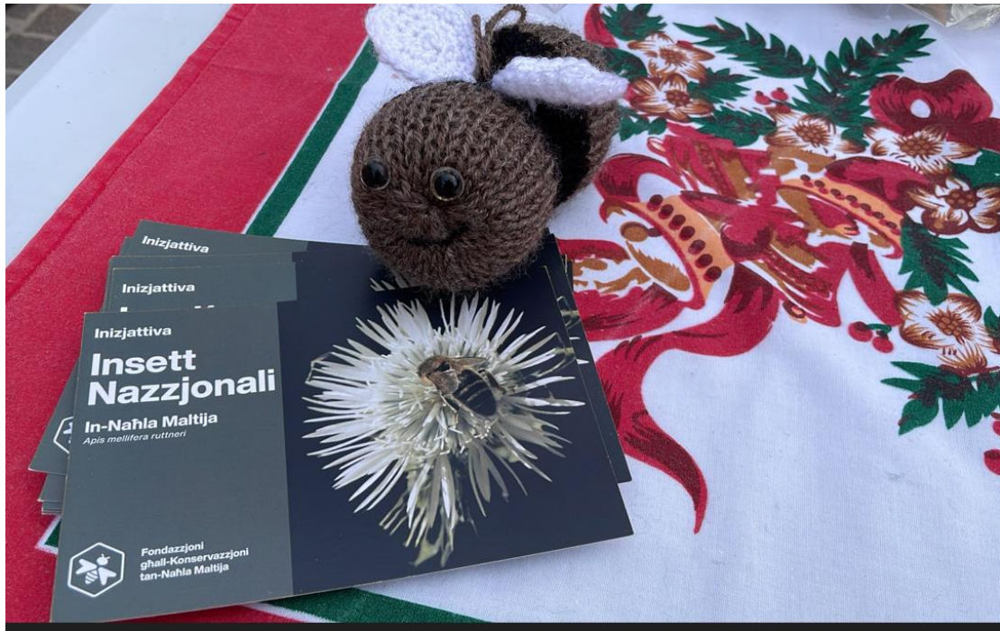
Hand-knitted Maltese Honey Bee, featuring characteristics of the local honey bee, such as its dark colour which will be distributed in recognition of their creativity to the top 15 students participating in this initiative