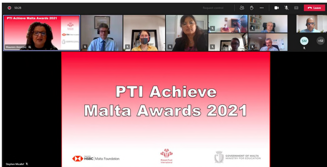
Caption: Screen grabs of the online event announcing the PTI Achieve Malta Awards winners which was sponsored by the HSBC Malta Foundation