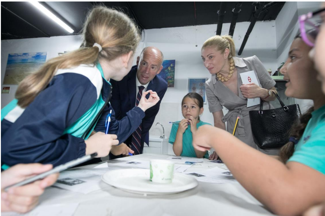
The STEM Camps @ Aquarium impart a hands-on experience to Year 4 students