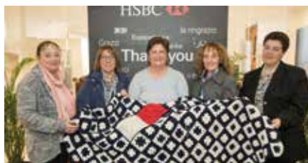
Donation of crochet blankets to Dar Merħba Bik.