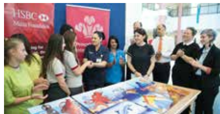
Students of the Achieve programme donated artwork to Mater Dei Hospital.