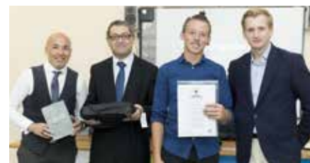
Graduates of the first ever PTI Achieve programme.