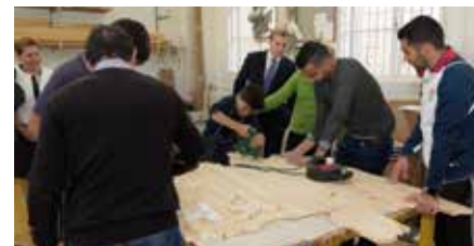
Visit by HSBC CEO at the Msida Educational Hub.