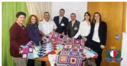
Donation of crochet blankets to the Department of Correctional Services Division.