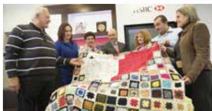
Donation of crochet blankets to Angel Tree Club and Aġenzija Appoġġ.