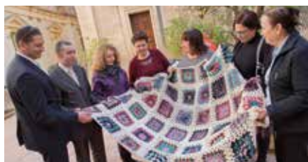
Donation of crochet blankets to the St Jeanne Antide Foundation.