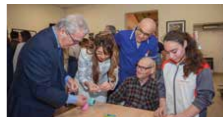
2019's Celebrating Success event was held at the national long-term care facility and brought two generations together.