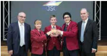
The top team received the Malta Junior Science Olympiad trophy sponsored by the HSBC Malta Foundation.