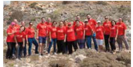
A group of HSBC staff gave a helping hand at the I-Land Observatory and Interpretation Centre.