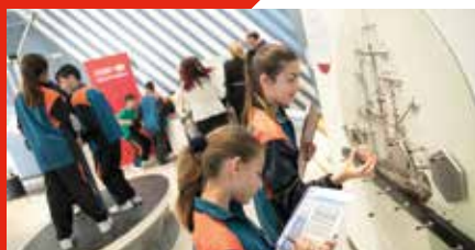
Year 7 (Form 1) students from St Nicholas College Middle School, Rabat were the first to enjoy the STEM Camps at Esplora.