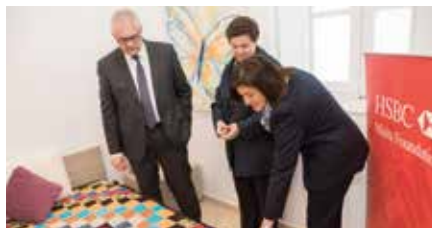
Donation of crochet blankets to Aġenzija Sapport.

Over 228 crochet blankets, some of them bearing stunning Maltese design motifs, were donated with the help of the HSBC Malta Foundation to a number of recipients: Hospice Malta, St Jeanne Antide Foundation, the Correctional Services Division, Angel Tree Club, Aġenzija Sapport, Aġenzija Appoġġ, Good Shepherd Community in Mosta and Dar Merħba Bik.