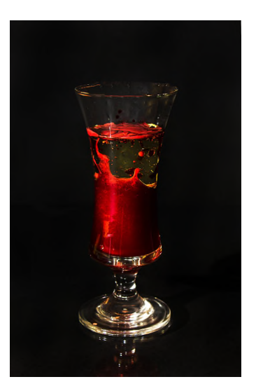
PHOTOCAPTION: The three winning photos of the STEM Photo Competition. Starting left to right the Biology photo, the Maths photo and the Chemistry themed photo